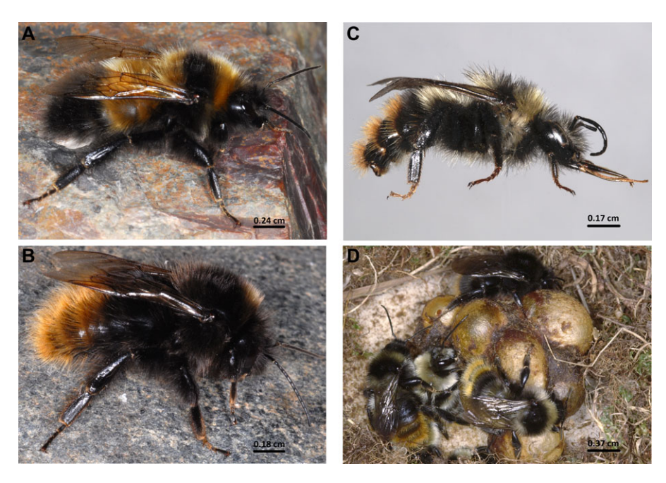
Fig. 1 Photos of the studied bumblebee species: (A) Bombus hyperboreus male (PRAS1067) from Alaska, USA (photo: P. Rasmont), (B) B. polaris male (PRAS0936) from Norway (photo: P. Rasmont), (C) B. inexspectatus male from Alps, Italy (photo: P. Rasmont), and (D) B. ruderarius male from Pyrenees, France (photo: P. Rasmont).

discuss the potential chemical strategies involved in these host-inquiline interactions.